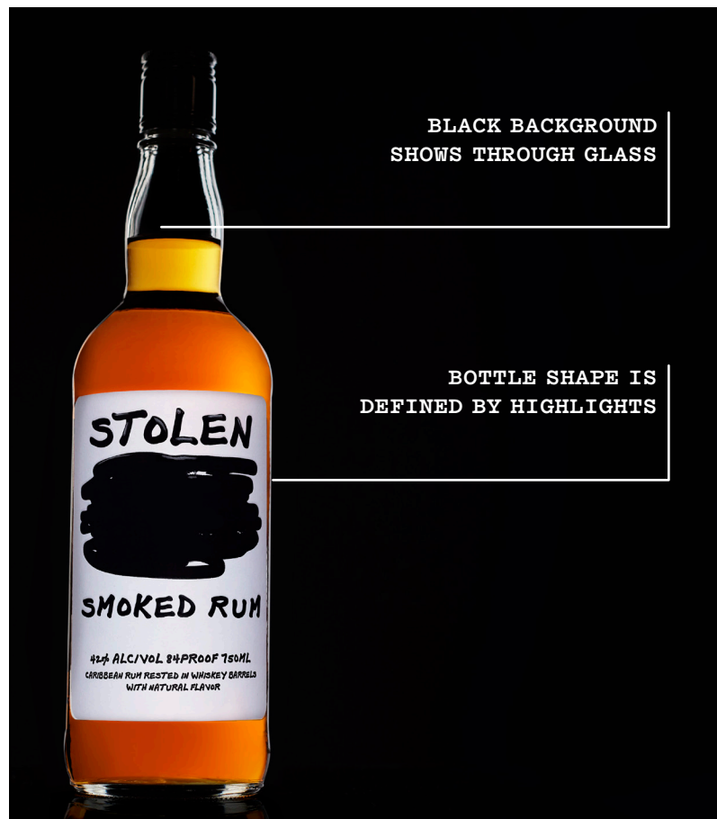
NIGHT VERSION EXAMPLE