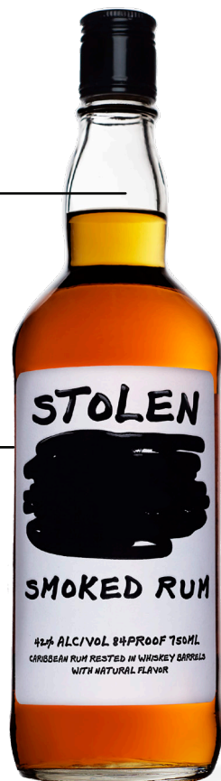
DAY VERSION EXAMPLE